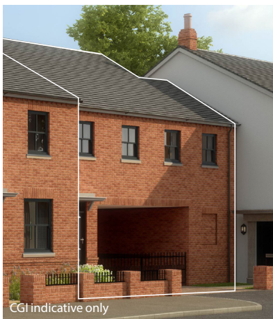
CGI indicative only